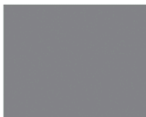
#60 Strata Gray